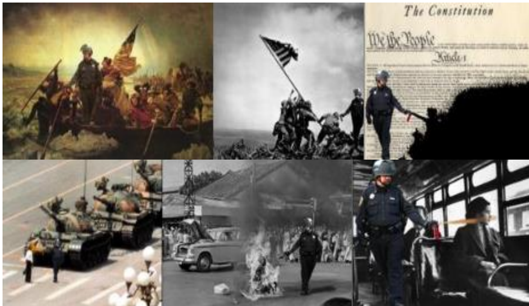
Figure 2. “Pepper Spray Cop” memes

Shifman (2014) notes that memes are heavily intertextual as a medium, relating to one another but also popular culture at large. Milner (2013) argues Occupy memes opened up discussion through appropriating popular culture. Intertextual creations like “Occupy Sesame Street” played on existing associations within audiences. The presence of pop culture increases accessibility and helps to link across strata of society, while also increasing messages’ chances of being shared. Similarly, the “Pepper Spray Cop” meme(s), which used an image of a University of California-Davis police officer nonchalantly pepper-spraying various photo-shopped figures, made use of “interdiscursive” connections to historic events: One set of iterations had him spraying famous activists, such as Tiananmen Square’s Tank Man and Rosa Parks, while another series inserted hallowed American iconography as targets, such as the Constitution, George Washington crossing the Delaware, and soldiers raising the American flag on Iwo Jima (Figure 2). These memes “interdiscursively linked historical events, contemporary news stories, and age-old discussion,” (Milner, 2013, p. 2363). While such connections increased ambiguity about the messages, they made for a powerful, potentially bridging rhetorical style (Dryzek, 2010), and were indispensable in imbuing them with the versatility and recognizability that popularized them.